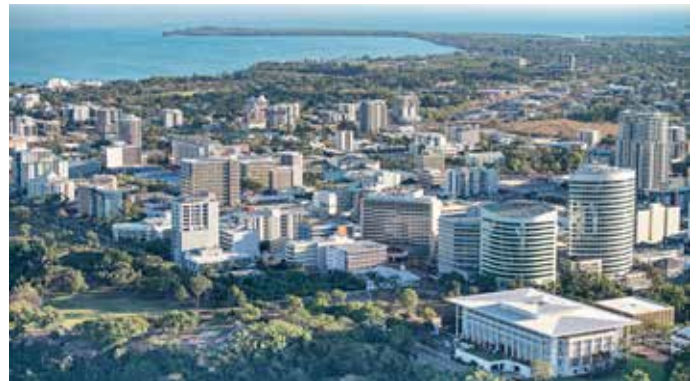
.... or booming Darwin