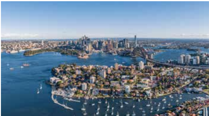
The 2012 choice: mediocre Sydney ....

What does the investor do? Her decision will impact on her financial future.